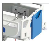
Modular Chart Holder