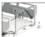
Orthopedic Traction Pulley