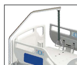
Heavy Duty SS Lifting Pole