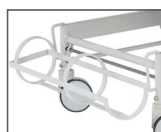
O2 Cylinder Cage