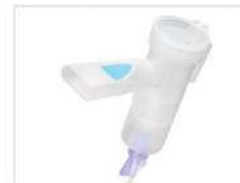
BW-4 Mouth type