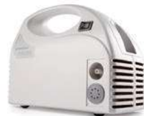
403C Air-compressing Nebulizer