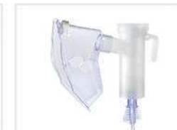
BW-5 Mask type for adult