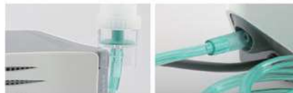
Safety hook for atomizing tube