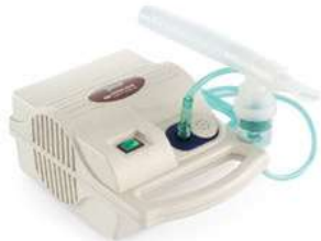
403B Air-compressing Nebulizer

Power supply: AC220 ± 22V, 50 ± 1Hz Max negative pressure compressing pump: ≥ 0.15MPa Free air flux compressing pump: ≥ 10L/min Max nebulizing rate: ≥ 0.1mL/min Operation noise: ≤ 65dB(A) Patent design for the clamping groove