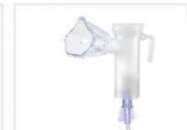
BW-6 Mask type for child

This product is suitable for the patient with respiratory disease to get the inhaling cure of the liquid or suspension medicine. It should be used with 403 series air-compressing nebulizer or oxygen concentrator.